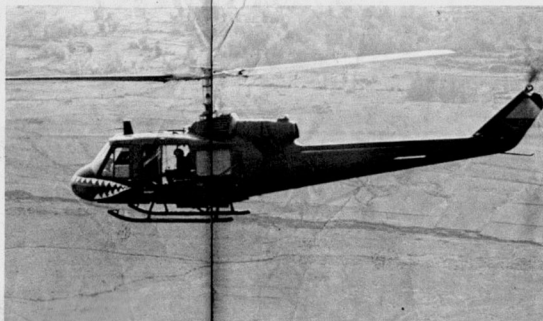
A LETHAL "SHARK" GUNSHIP OF THE 174TH AVIATION COMPANY BARES ITS TEETH ABOVE DUC PHO.