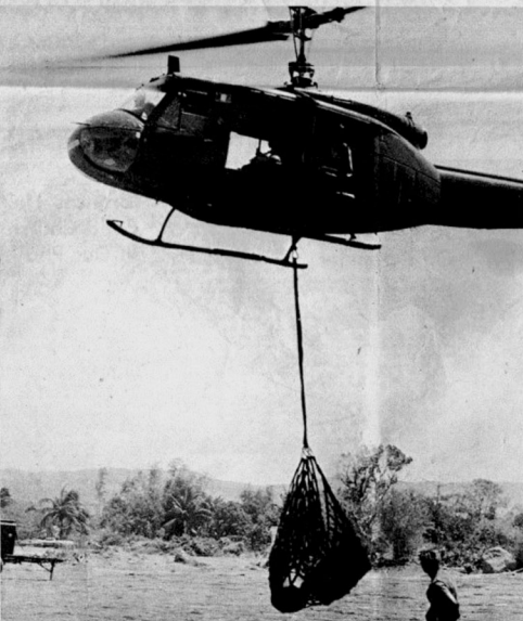
A "DOLPHIN" SLINGS A LOAD OF FUEL TO RESUPPLY TANKS WORKING WITH THE 3RD BRIGADE.