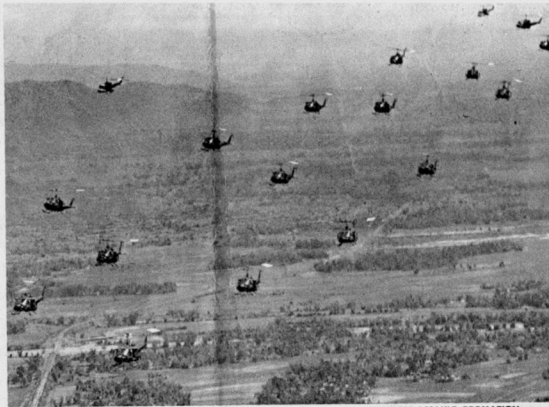
HELICOPTERS OF THE 174TH AVIATION COMPANY FLY IN PRECISION ASSAULT FORMATION.