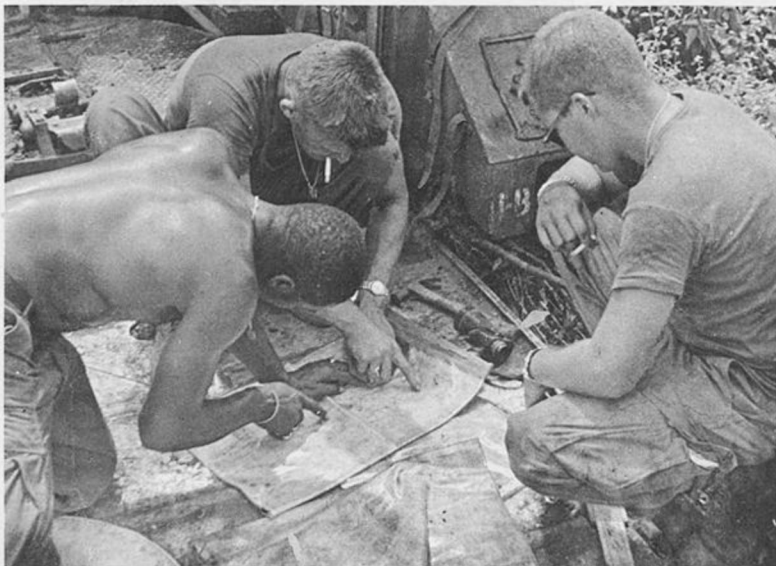
FIRE MISSION—Men of Troop B, 1st Squadron, 10th Cavalry plot 4.2-inch mortar firing while the Ivy Division unit moves near Duc Co on Operation Francis Marion.

That little black object on the front of the APC? "We really use that," he added. "It's a horn to keep the village kids off the road when we come rolling through."