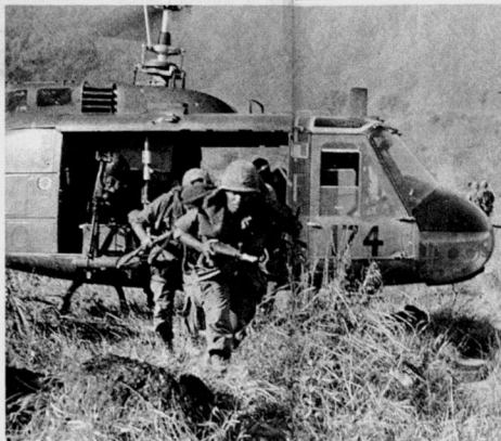
"BRONCO" BRIGADE IVYMEN CHARGE FROM A "DOLPHIN" DURING A COMBAT ASSAULT.