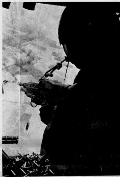
A "SHARK" GUNNER FIRES A BURST FROM HIS M-60 AT VC GUERRILLAS.